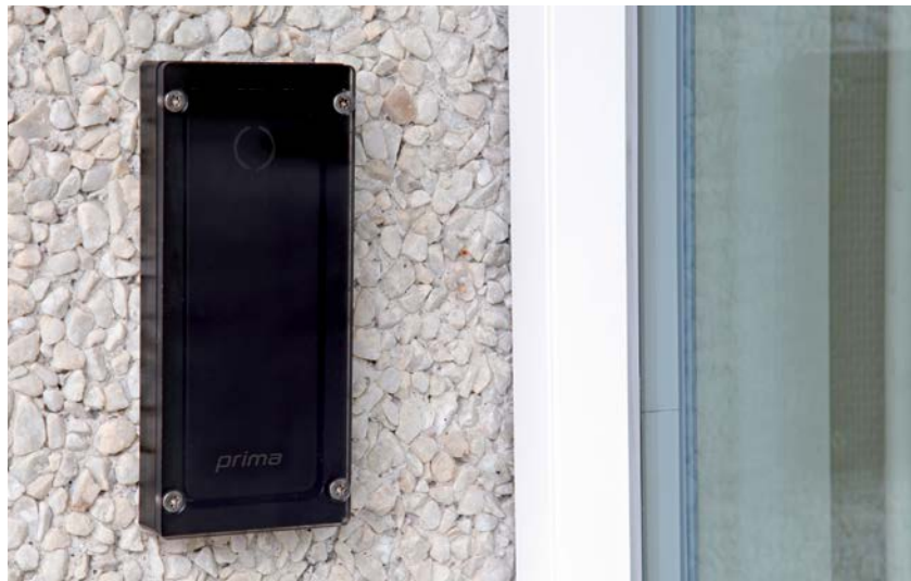
Both vandalism shields have a simple yet exclusive design. Both solutions have been thoroughly tested and can resist wilful tampering

You can choose between two solutions. One solution offers protection of the reader by mounting a vandalism shield on top of the reader. The shield has a polycarbonate lexan plate which covers the front of the reader, protecting it from damages. This solution is suitable for MIFARE readers, and for protection of already installed Prox and MIFARE readers. The second solution offers positioning an reader safely on the inside of the door, and linking this to an antenna fixed behind a sturdy stainless steel shield (for Prox only).