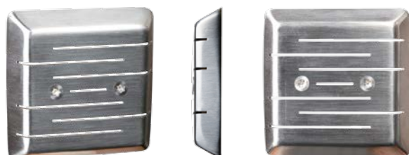
Anti-vandal shield adds an extra protection.